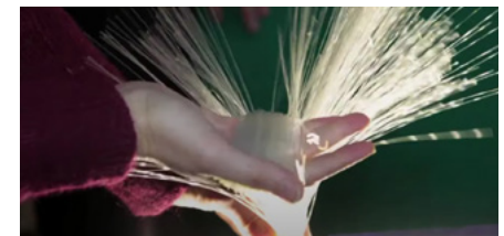
The base technologies are novel piezo plastics and flexible organic light-emitting diodes (OLEDs).