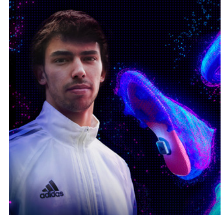
Jacquard™ by Google weaves new digital experiences into the things you love, wear, and use every day to give you the power to do more and be more.