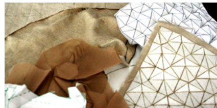
Zygomatic is a tessellating shirt controlled by a computer interface.