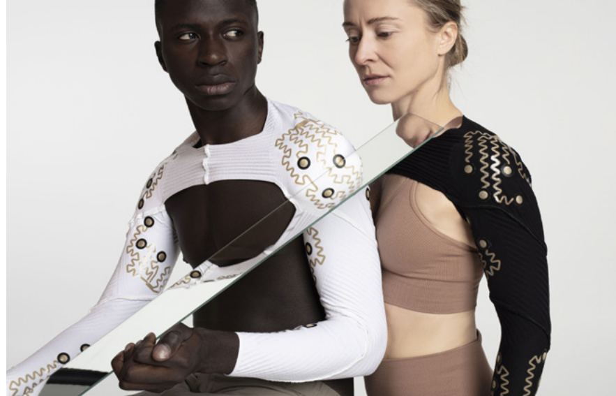
The project Re-FREAM was created to design smart clothes in the digital area.