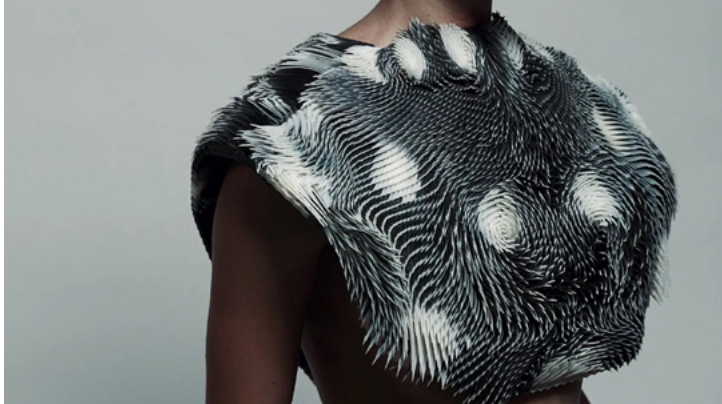
Caress of the Gaze. A 3D-printed, gaze-actuated wearable.