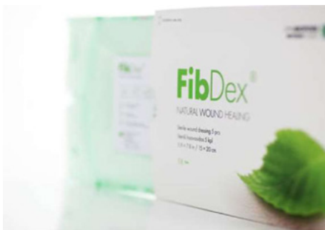
FibDex - Nature's protective barrier.