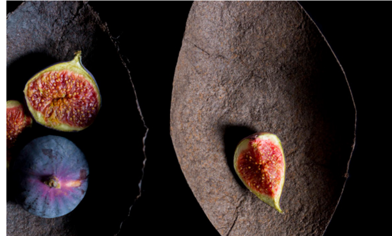
KAARNI - Biodegradable plate made out of bark.