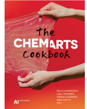
The CHEMARTS Cookbook - recipes for wood- based material experimentations.