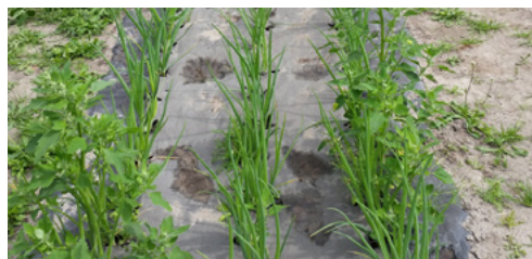
Walki® Agripap is made from kraft paper that is coated with a biodegradable layer, which slows down the degradation of the paper.